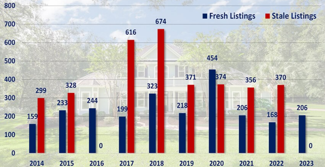
# Days From Listing To Closing For Homes Sold Above $1M